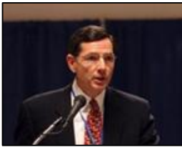
Sen. John Barrasso

R-HoPE would boost reimbursement payments to rural hospitals, and it would create a new loan program to help rural hospitals repair aging buildings.